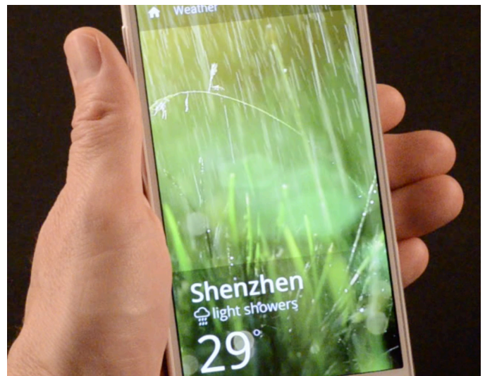
Applications enhanced with tactile effects, such as weather apps or OEM essentials, are more engaging and sticky.

The TS Haptic Enabling Kit is an end-to-end offering that enables creation, distribution and the playback of tactile effects. Immersion provides integration services, hardware selections guidelines, custom effect design support and reference guides to help device makers implement haptics in their products.